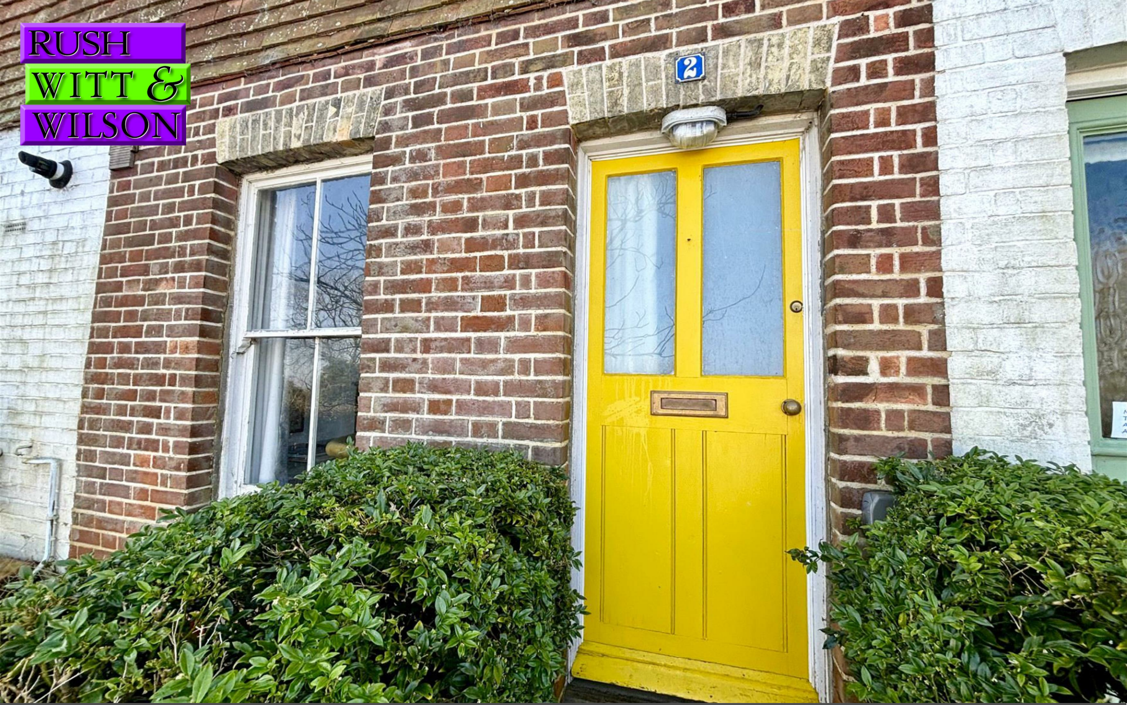
2 Landgate Cottages North Street, Winchelsea, TN36 4HS Guide Price £325,000 Freehold